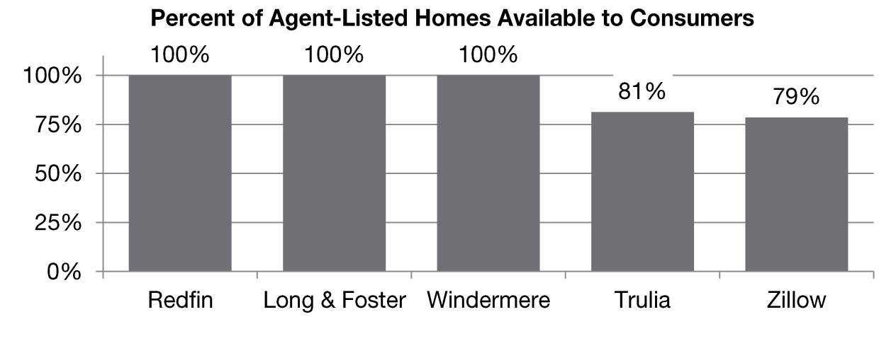
Figure 1 – Listing Completeness

Each of the local real estate brokerage websites analyzed contained 100% of the homes listed for sale in the MLS. Portal sites contained just 79% to 81% of these listings—a fifth of the homes for sale did not appear on portal sites.